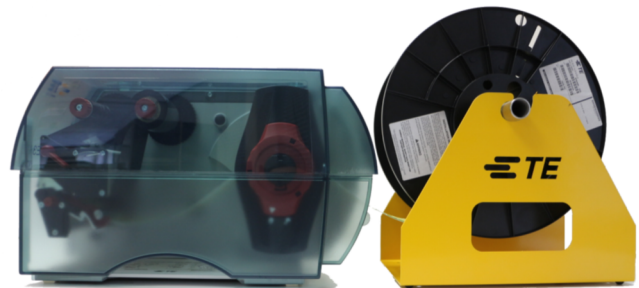
TE3124 with Universal payoff