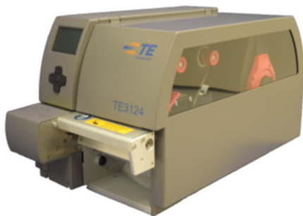
TE3124 fitted with, metal cover and Cutter/Perforator